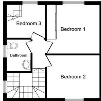
First Floor Floor area 36.0 sq.m. (387 sq.ft.)