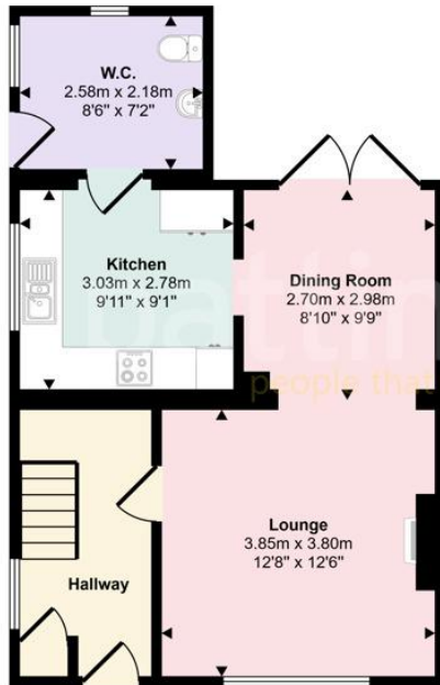
Ground Floor Approx 47 sq m / 506 sq ft

Approx Gross Internal Area 89 sq m / 953 sq ft