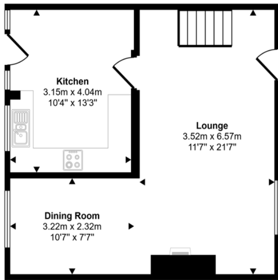
Ground Floor Approx 45 sq m / 485 sq ft

Approx Gross Internal Area 90 sq m / 971 sq ft