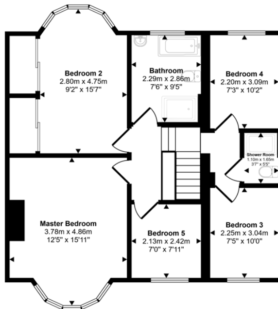
First Floor Approx 73 sq m / 786 sq ft

This floorplan is only for illustrative purposes and is not to scale. Measurements of rooms, doors, windows, and any items are approximate and no responsibility is taken for any error, omission or mis-statement. Icons of items such as bathroom suites are representations only and may not look like the real items. Made with Made Snappy 360.